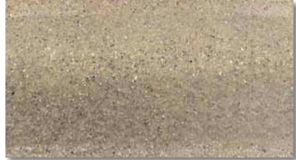
Extra coarse blend with exceptional wearing properties