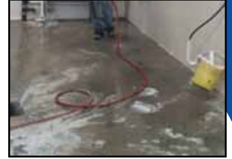
VSC CONCRETE CLEAN & ETCH Prep