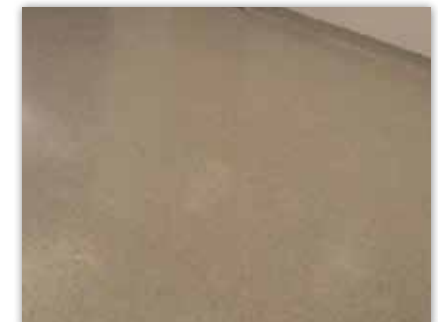
VSC COLOR-STONE blends offer a wide variety of tweed blends for attractive and tough wearing overlays. Available in MEDIUM or COARSE.