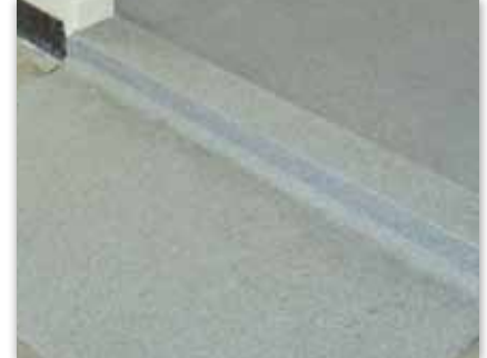
VSC MEDIUM is our most popular aggregate blend. It is used with the Natural ARMORCOAT (Clear) EPOXY or WITH MANY COLOR OPTIONS!