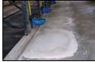
Level Eroded Zones with CON-KORITE™ MORTAR