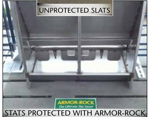
STATS PROTECTED WITH ARMOR-ROCK

When all other attempts to save slats from corrosive elements have failed, ARMOR-ROCK is today's best solution!