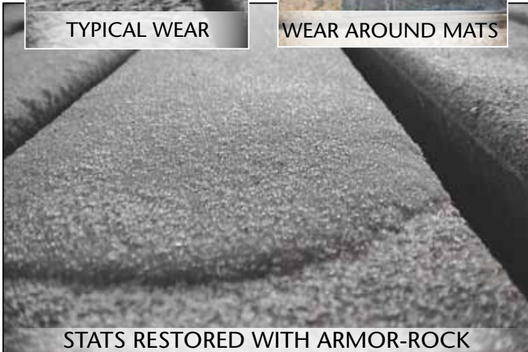
STATS RESTORED WITH ARMOR-ROCK