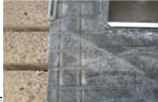
WEAR AROUND MATS